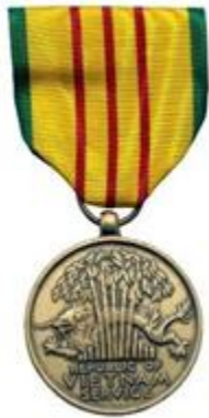
Figure A15.12. Vietnam Service Medal.

A15.13.1. To qualify for award of the Vietnam Service Medal a member must meet one of the following qualifications (T-0):