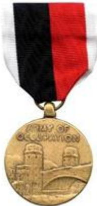
Figure A15.6. Army of Occupation Medal.

A15.7.1. The medal is awarded for 30 consecutive days service at a normal place of duty while assigned to or serving with the U.S. Occupation Forces during the timeframe after World War II.