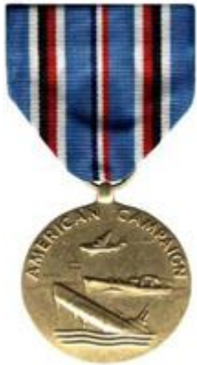
Figure A15.3. American Campaign Medal.

A15.4.1. The medal was established by EO 9265, and announced in War Department Bulletin 56, 1942, and amended by EO 9706, 15 March 1946. It is awarded for service within the American Theater between 7 December 1941 and 2 March 1946 under any of the following conditions: