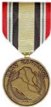
Figure A13.7. Iraq Campaign Medal Illustration.

A13.8.1. The period of eligibility for the medal is 9 March 2003 to 31 December 2011, and the area of eligibility encompasses all land and air space of the country of Iraq, to include the contiguous water and air space out to 12 nautical miles. To coincide with the change of mission for U.S. forces in Iraq, effective 1 September 2010, Operation IRAQI FREEDOM was changed to Operation NEW DAWN.