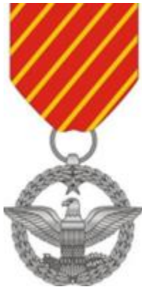
Figure A14.1. Combat Action Medal Illustration.

A14.2. Combat Action Medal (CAM). On 15 March 2007, SecAF approved the establishment of the CAM to recognize members of DAF (grades E-1 through O-6) who actively participated in ground or air combat. On 16 November 2020, SecAF approved the renaming of the Air Force Combat Action Medal to the Combat Action Medal.