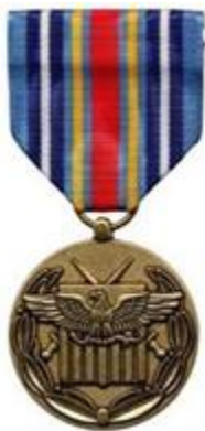
Figure A13.9. Global War on Terrorism Expeditionary Medal Illustration.

A13.10. Global War on Terrorism Expeditionary Medal (GWOTEM). The medal was established by EO 13289, 12 March 2003, to recognize members of the U.S. Armed Forces who deployed abroad for service in the War on Terrorism operations on or after 11 September 2001 to a date to be determined.