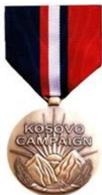
Figure A13.5. Kosovo Campaign Medal Illustration.

A13.6.1. Eligibility. Members authorized the medal must have participated in or served in direct support of Kosovo operations within the Kosovo Air Campaign or the Kosovo Defense Campaign areas of eligibility. Refer to Tables A13.3 and A13.4 .