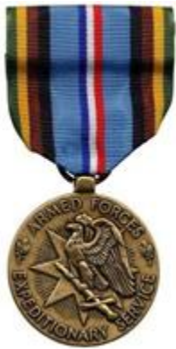
Figure A13.4. Armed Forces Expeditionary Medal Illustration.