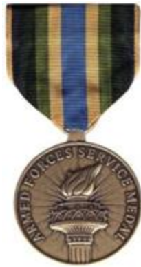
Figure A13.12. Armed Forces Service Medal Illustration.