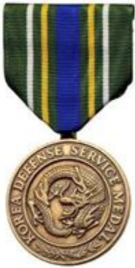
Figure A13.11. Korea Defense Service Medal Illustration.