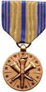
Figure A13.15. Armed Forces Reserve Medal Illustration.