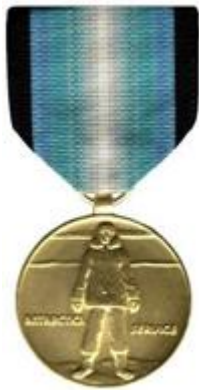
Figure A13.3. Antarctica Service Medal Illustration.