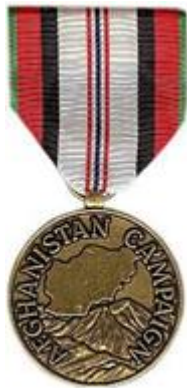
Figure A13.6. Afghanistan Campaign Medal Illustration.

A13.7.1. The period of eligibility for the medal is 11 September 2001 to 31 August 2021, and the area of eligibility encompasses all land and air space of the country of Afghanistan.