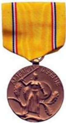
Figure A15.4. American Defense Service Medal.

A15.5.1. The American Defense Service Medal was established by EO 8808, and announced in War Department Bulletin 17, 1941. It is awarded for service between 8 September 1939 and 7 December 1941 under orders to active duty for a period of 12 months or longer.