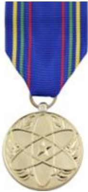
Figure A14.11. Nuclear Deterrence Operations Service Medal Illustration.