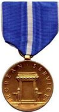
Figure A15.9. Korean Service Medal.

A15.10.1. The Korean Service Medal is awarded to personnel who were assigned or attached to combat or service units designated by the Commander, Far East Air Forces, in general orders for service within the Korean Theater or adjacent areas between 27 June 1950 and 27 July 1954. The term “Korean Theater” as used in this publication includes the areas that encompass North and South Korea, Korean waters, the air over North and South Korea, and the air over Korean waters.