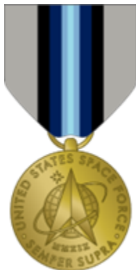
Figure A14.5. Space Force Good Conduct Medal Illustration.

A14.5. Space Force Good Conduct Medal (SFGCM). The medal was established by the Secretary of the Air Force on 30 August 2023, by authority of the 3 October 2022 amendment to Executive Order 8809. The medal is awarded to enlisted members for “exemplary conduct” (honor, efficiency, and fidelity), while on active military service with the United States Space Force on or after 20 December 2019.