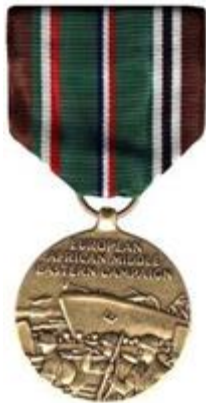
Figure A15.8. European-African-Middle Eastern Campaign Medal.

A15.9.1. The medal is awarded for service within the European-African-Middle Eastern Theater between 7 December 1941 and 8 November 1945.