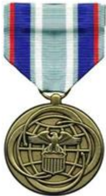
Figure A14.10. Air and Space Campaign Medal Illustration.

A14.10. Air and Space Campaign Medal (ASCM). The medal was established by SecAF on 24 April 2002, to recognize DAF members who, after 24 March 1999, participated in or directly supported a significant U.S. military operation designated by CSAF or CSO, as qualifying for the medal.