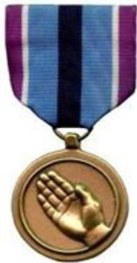
Figure A13.13. Humanitarian Service Medal Illustration.

A13.14. Humanitarian Service Medal. The medal was established by EO 11965, to recognize members who, after 1 April 1975, distinguished themselves by meritorious direct participation in a DoD-approved significant military act or operation of a humanitarian nature.