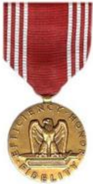
Figure A15.5. Army Good Conduct Medal.

A15.6.1. The medal recognized enlisted members who honorably completed three continuous years of active military service. Members must have demonstrated a positive attitude toward the Air Force and their jobs. (T-1)