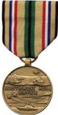
Figure A15.11. Southwest Asia Service Medal.

A15.12.1. Members serving in Israel, Turkey, Syria, and Jordan (including the airspace and territorial waters) directly supporting combat operations from 17 January 1991 through 30 November 1995 are also eligible for the Southwest Asia Service Medal.