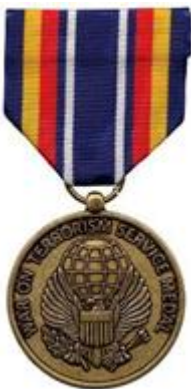
Figure A13.10. Global War on Terrorism Service Medal Illustration.

A13.11.1. Refer to Table A13.10 for eligible operations.