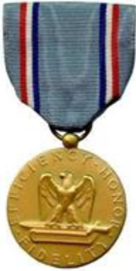
Figure A14.4. Air Force Good Conduct Medal Illustration.