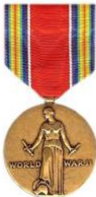
Figure A15.14. World War II Victory Medal.

A15.15. World War II Victory Medal. The medal was established by an act of Congress on 6 July 1945.