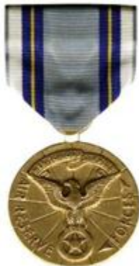
Figure A14.6. Air Reserve Forces Meritorious Service Medal Illustration.

A14.6. Air Reserve Forces Meritorious Service Medal (ARFMSM). The medal was established on 7 April 1964.