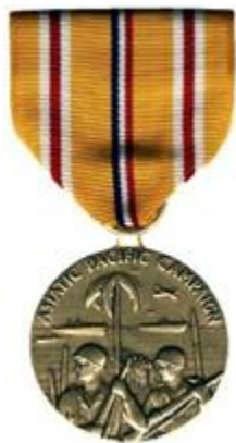
Figure A15.7. Asiatic-Pacific Campaign Medal.

A15.8.1. The medal is awarded for service within the Asiatic-Pacific Theater between 7 December 1941 and 2 March 1946 under any of the following conditions: