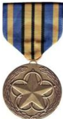
Figure A13.14. Military Outstanding Volunteer Service Medal Illustration.

A13.15. Military Outstanding Volunteer Service Medal (MOVSM). The medal was established by EO 12830, to recognize service members who, after 31 December 1992, perform outstanding volunteer community service of a sustained, direct, and consequential nature.