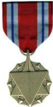
Figure A14.2. Combat Readiness Medal Illustration.

A14.3.1. Eligibility. The CRM is awarded for sustained individual combat mission readiness or preparedness for direct weapon-system employment, after 1 August 1960.