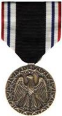
Figure A13.1. Prisoner of War Medal Illustration.

A13.2. Prisoner of War Medal. The POW medal was established by 10 USC § 1128, to recognize qualifying individuals who, while serving in a capacity with the Military Departments, were taken prisoner and held as prisoners of war.