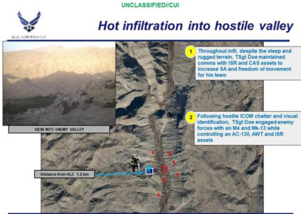
Figure A12.6. Sample Story Board.