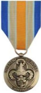
Figure A13.8. Inherent Resolve Campaign Medal Illustration.

A13.9. Inherent Resolve Campaign Medal. The medal was established by EO 13723, to recognize service members for qualifying service on or after 15 June 2014.