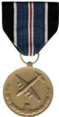
Figure A15.10. Medal for Humane Action.

A15.11.1. The medal is awarded to members of the U.S. Armed Forces and to others when recommended for meritorious participation, for service in the Berlin Airlift. Service must have been for at least 120 days during the period of 26 June 1948 and 30 September 1949, and in the following boundaries of the Berlin Airlift Operations Area. (T-0)