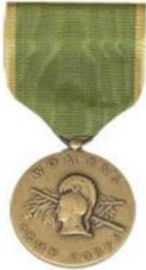
Figure A15.13. Women's Army Corps Service Medal.

A15.14.1. The medal was awarded to female members of the Army for military service under either of the following: